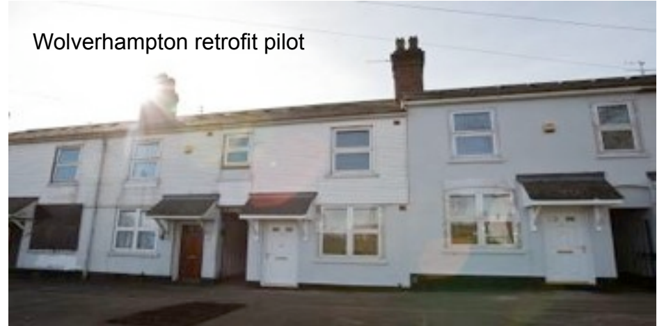
Wolverhampton retrofit pilot