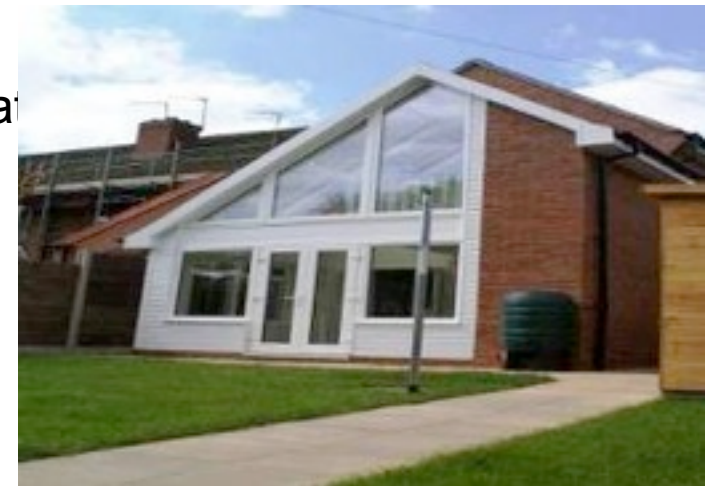
Clay Lane, Penkridge in Staffordshire. Retrofitting homes, reducing carbon emissions and improving heat retention by 20%